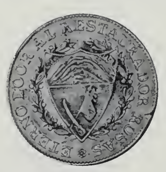
Lot No. 2438

Confederation under the Dictator Rosas. 8 Escudos, 1845 R-B. La Rioja. Obv. Arms of the Confederation. Rv. Provincial Arms of La Rioja. KM 19, Fr.13. A one-year type. There are two very minor edge bruises on the obverse and a slight edge flaw on the reverse. However, on the whole a desirable example of this very rare issue, with original surface lustre in the legends. Very Fine.